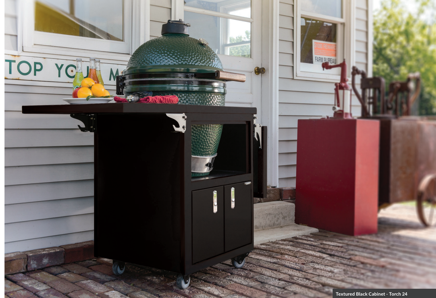
Textured Black Cabinet - Torch 24