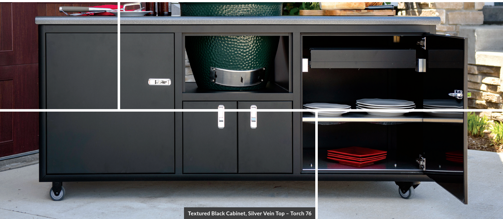
Textured Black Cabinet, Silver Vein Top - Torch 76