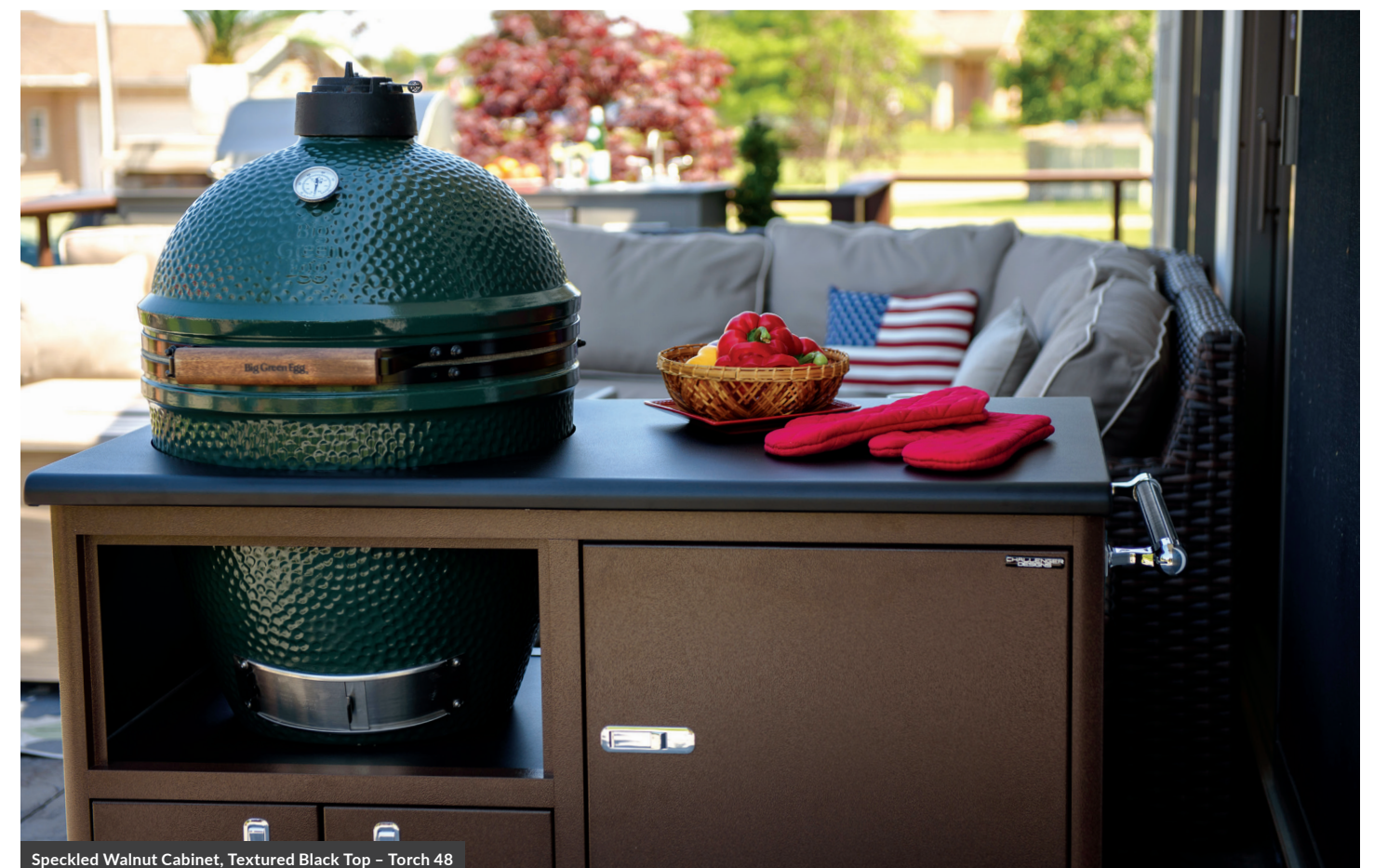
Speckled Walnut Cabinet, Textured Black Top - Torch 48